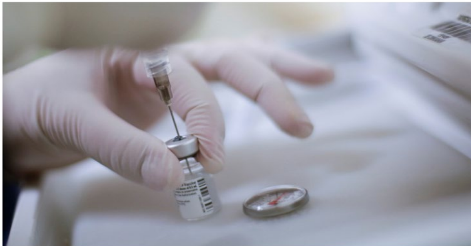
A health worker prepares an injection with a dose of the Pfizer/BioNTech COVID-19